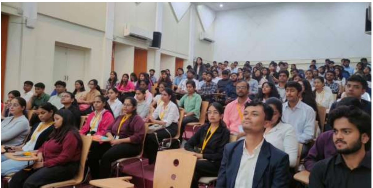
Pre-Placement Talk for ICICI BANK