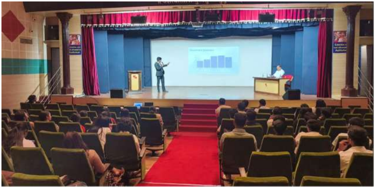
Orientation Sessions for First and Second Year UG and First Year PG Students