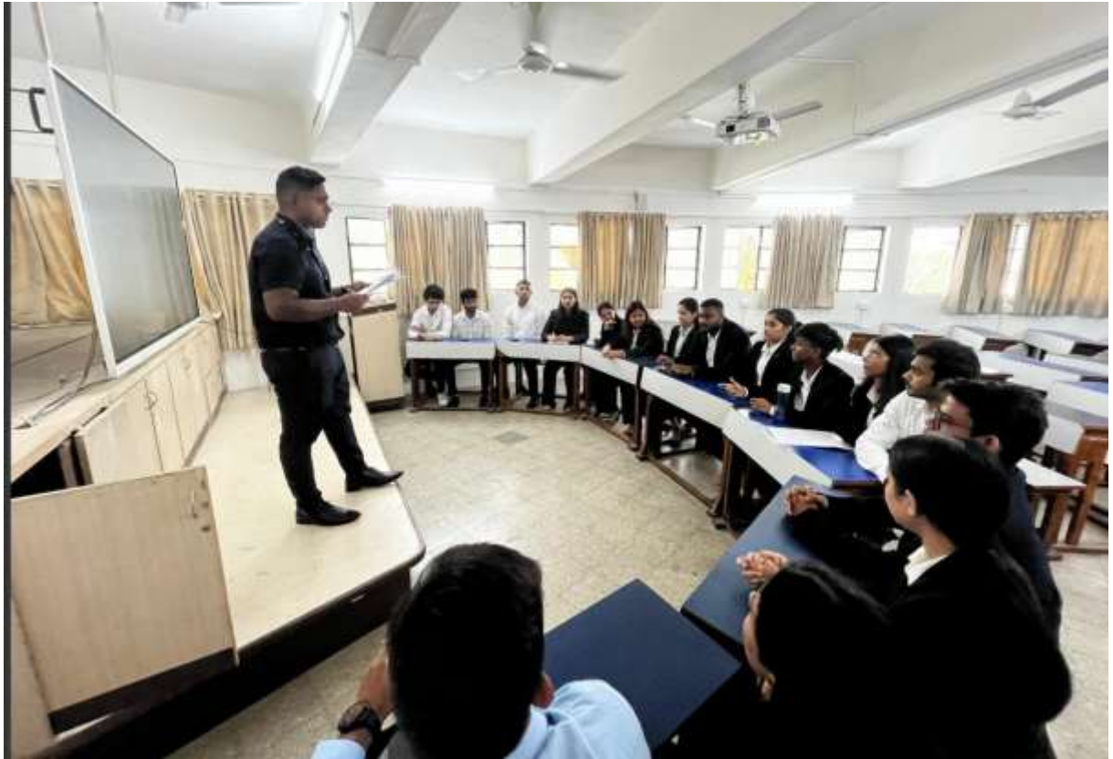
Group Discussion rounds for EY GDS