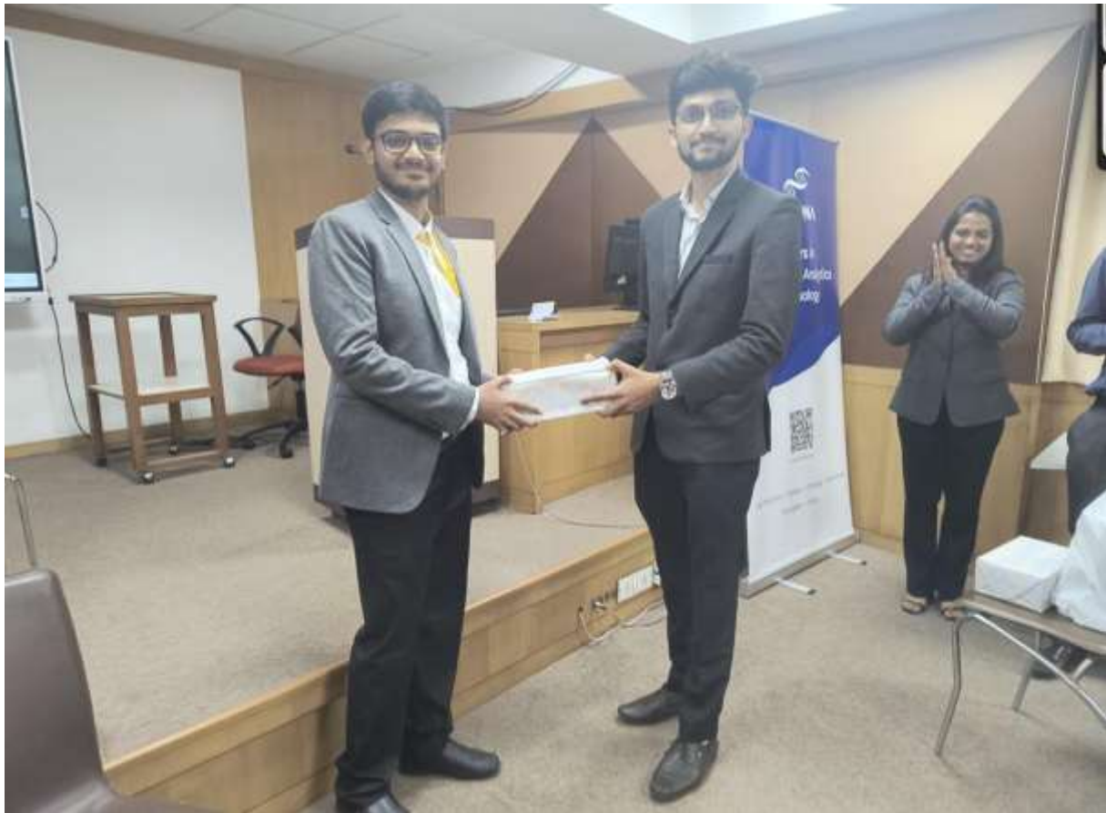
Placement Drive for ProcDNA