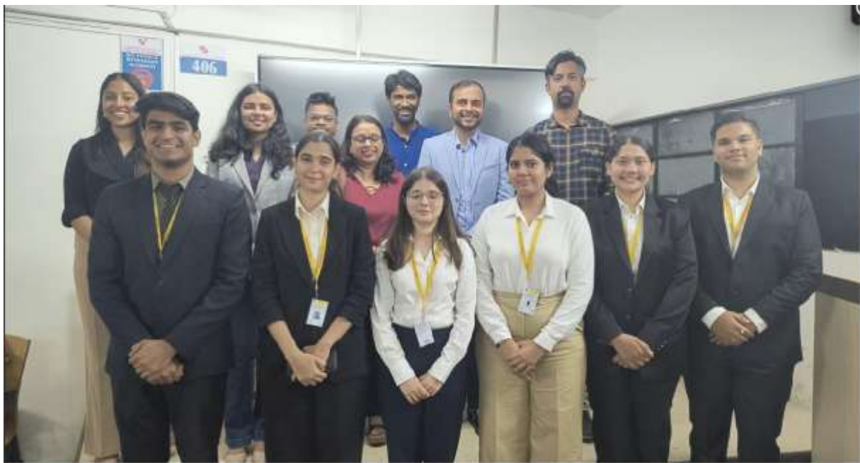
Internship Drive for the ACA GROUP