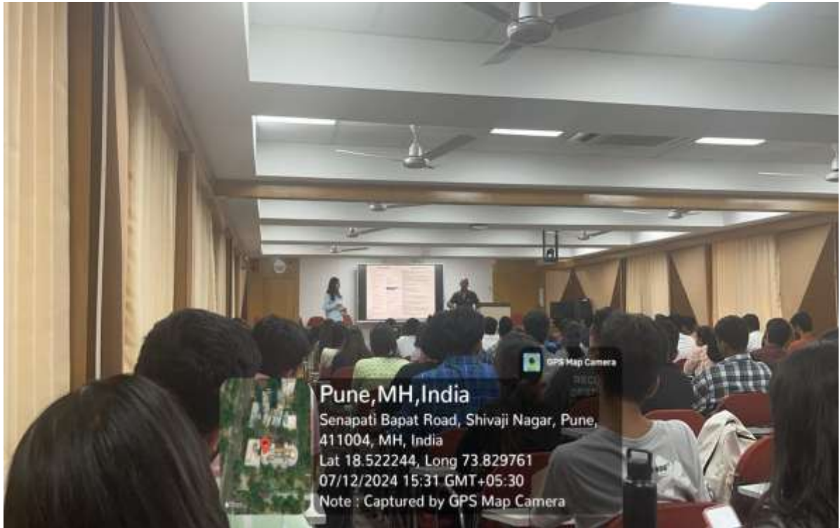
Resume Writing session by ACA Global Professional